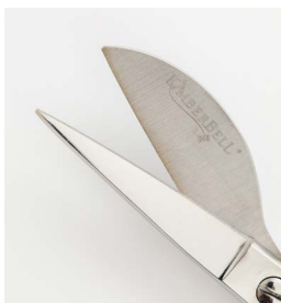
5" DUCKBILL APPLIQUE Narrow ½" blade protects base fabric and tack-down stitches while trimming applique pieces.