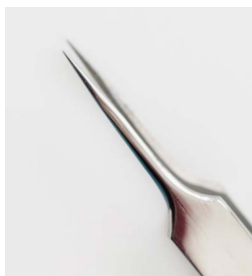
PRECISION FINE TIP TWEEZERS WITH BLADE Holds fine threads for clipping. Easily unpicks basting stitches with blades on all four sides.