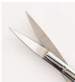
SHARP SNIPS Curved blades cut away from fabric to trim intricate details of Kimberbell applique pieces.